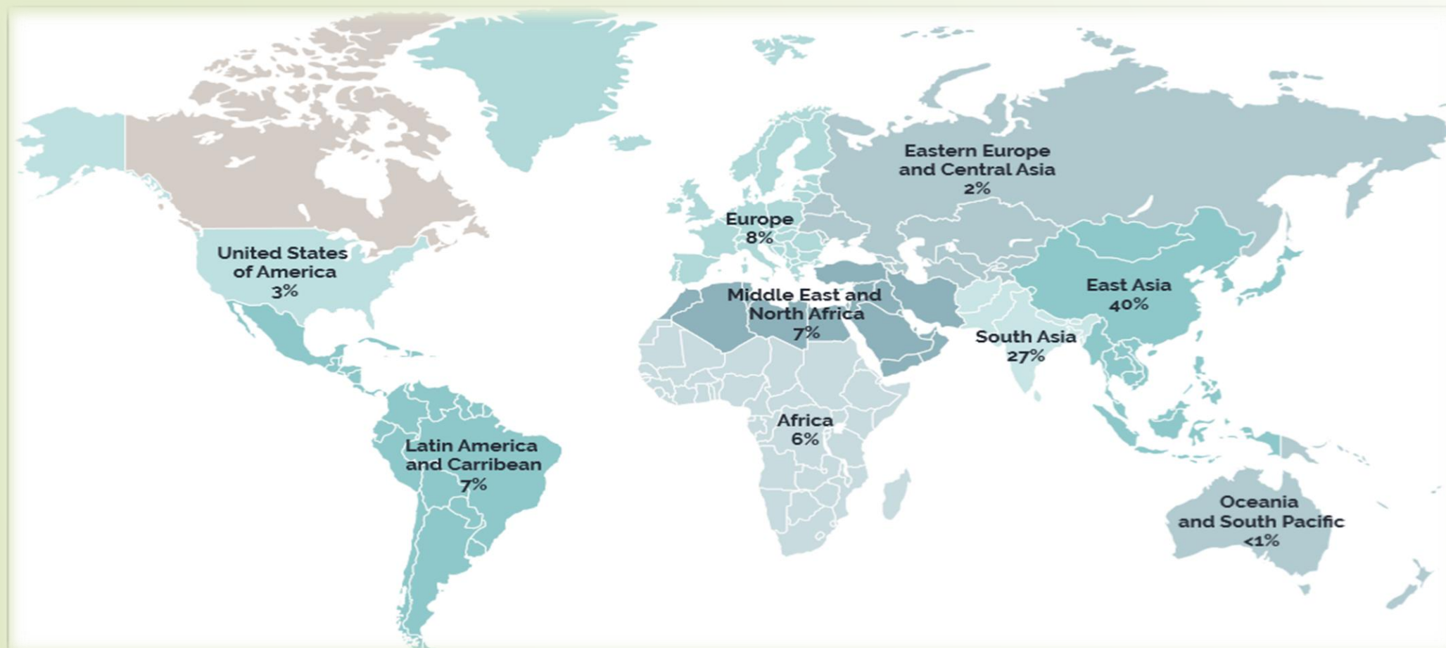
Figure 1: This is a map from the Canadian Bureau of International Education (CBIE) shows statistics on the countries of origin for Canada's international students in 2017.